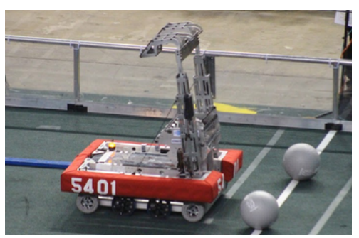
Stronghold- 2016 Robot