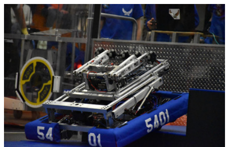
Deestination: Deep Space - 2019 Robot