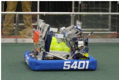
Steamworks - 2017 Robot